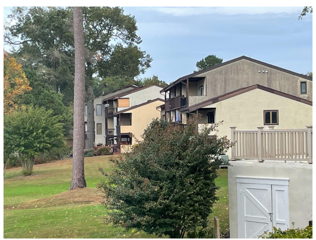
Townhouses C and D

While some progress on townhouse repairs has begun, many more are still in need of repair/painting. The first picture of Townhouses C and D show variations in color. Recently two of the townhouses have been painted and the difference is dramatic. Our hope is this becomes contagious!